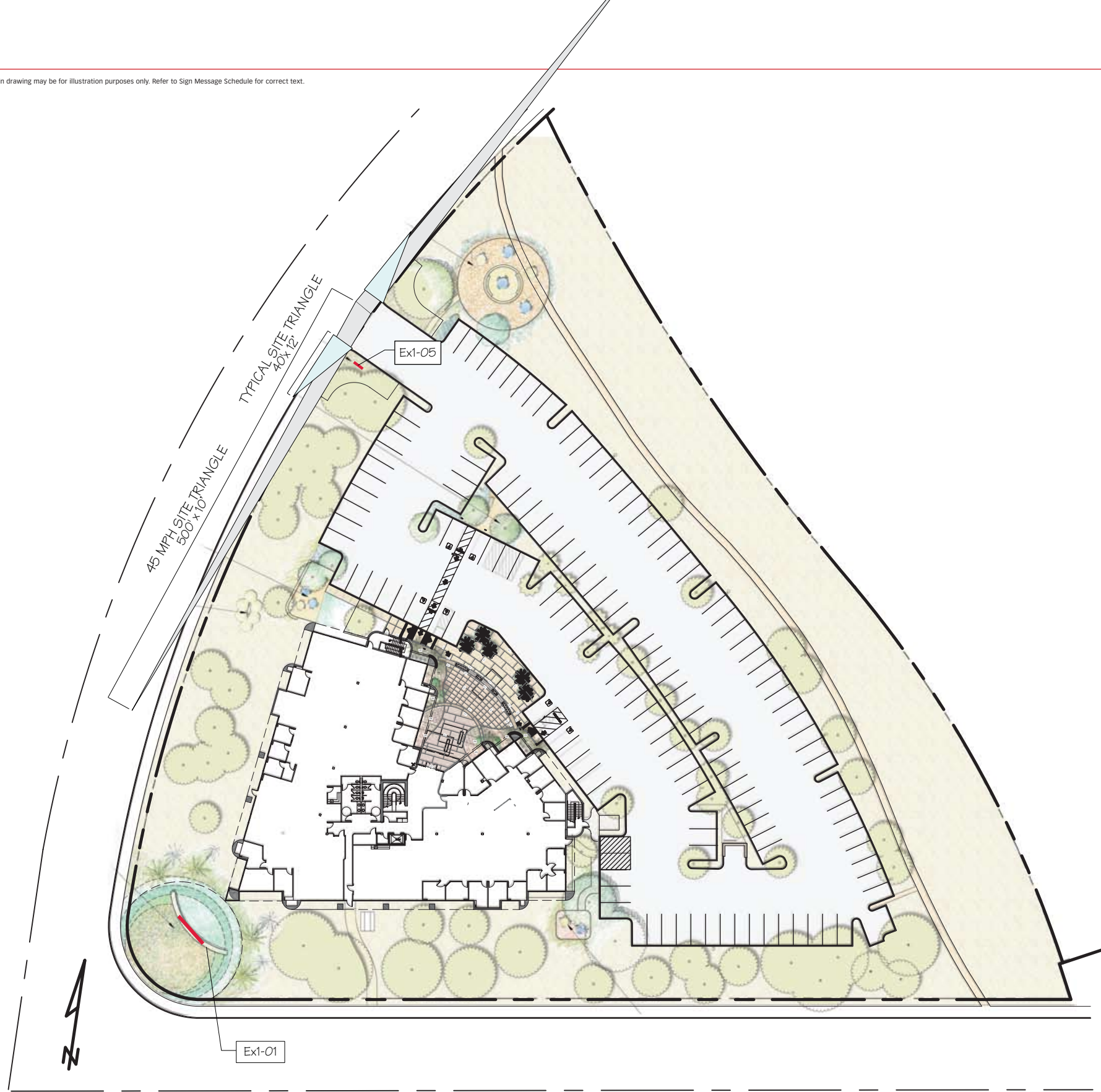
EXISTING SITE PLAN Scale : 1/64" = 1'-0"