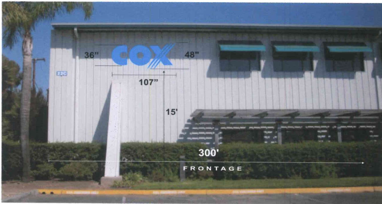
Existing Wall Sign Panel sign, wood w/vinyl graphics

Non illuminated dimensional letters 3" deep HDU material