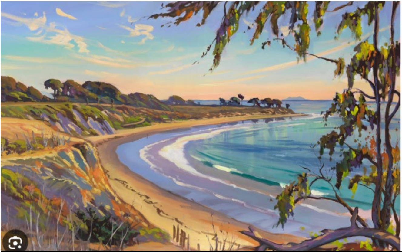
Figure 2 Chris Potter painting from proposed "Potter's Point"