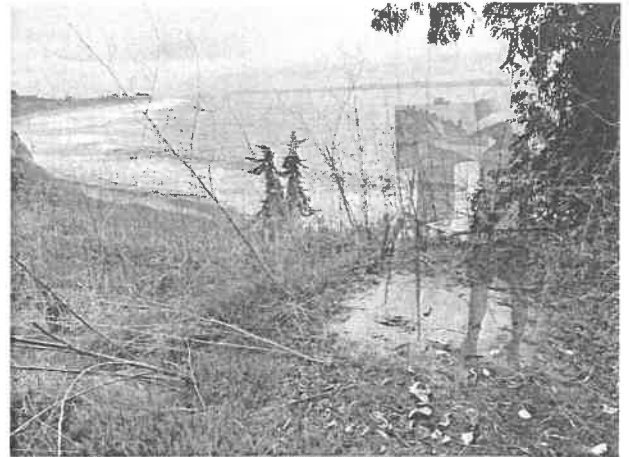
Potter's Point