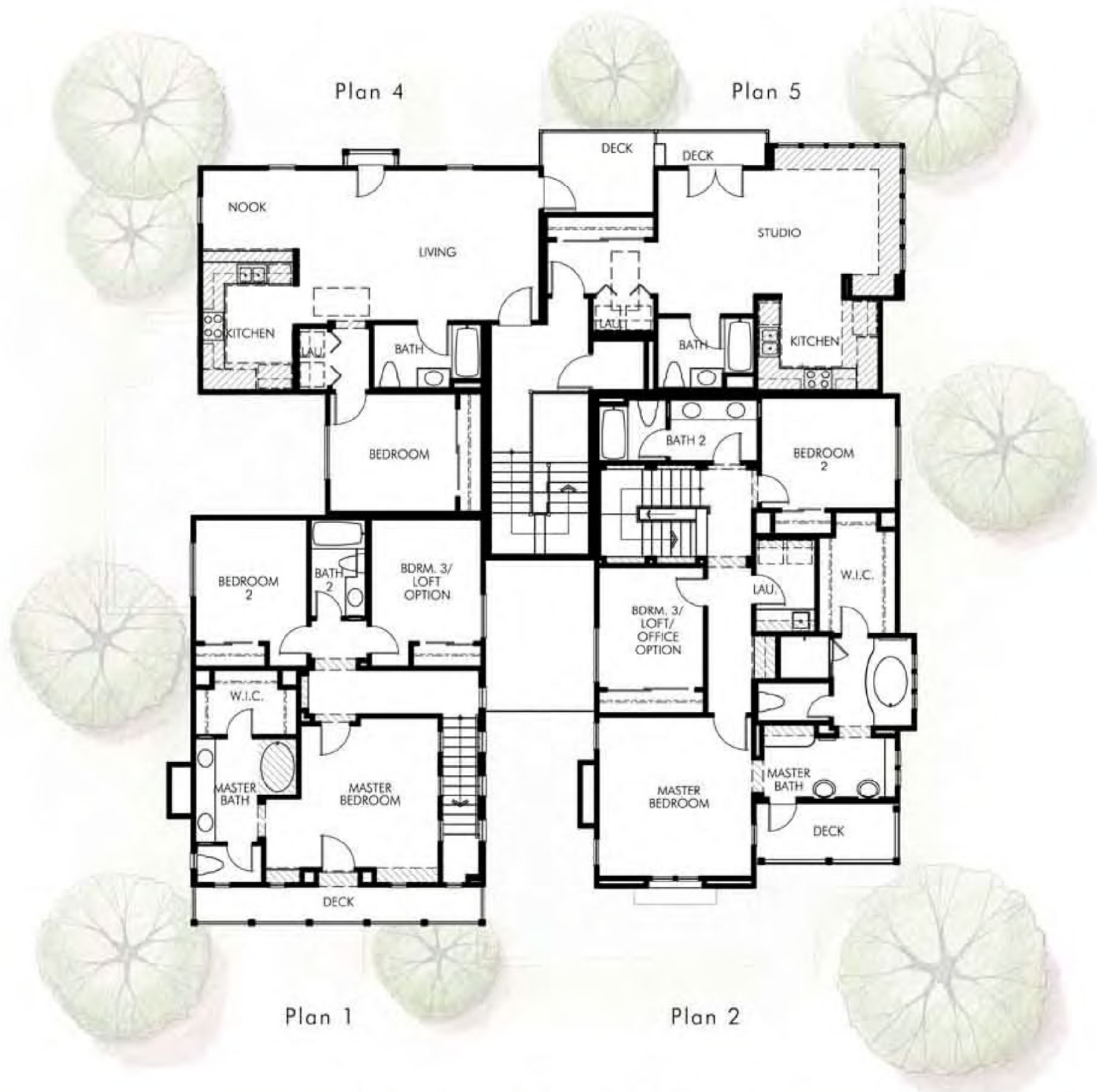
FOUR-PLEX - SECOND FLOOR PLAN AFFORDABLE UNITS