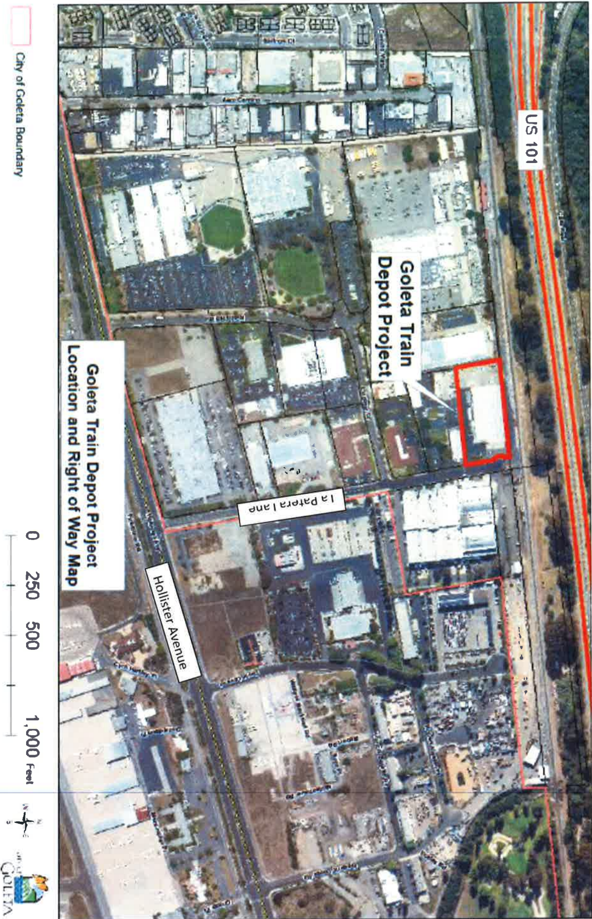
FIGURE 1 – Project Location Map.

Site Address: 27 South La Patera Lane, cross street Hollister Avenue in Goleta, CA 39117