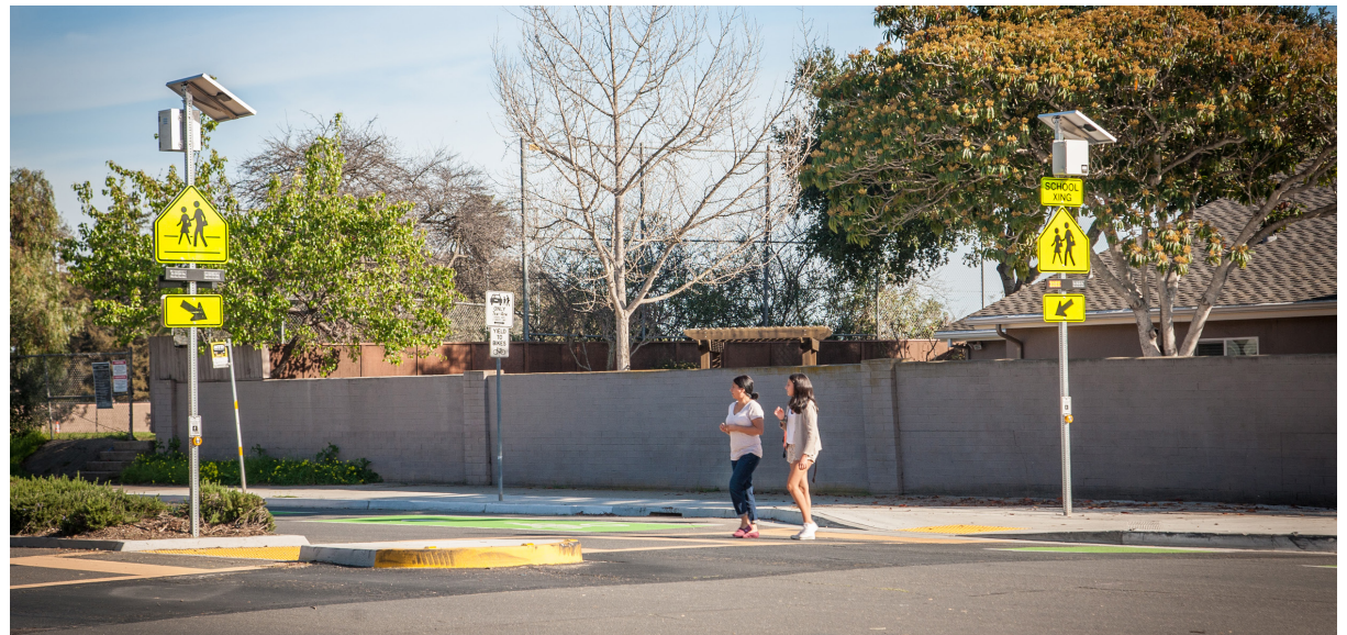
Rectangular Rapid Flashing Beacon