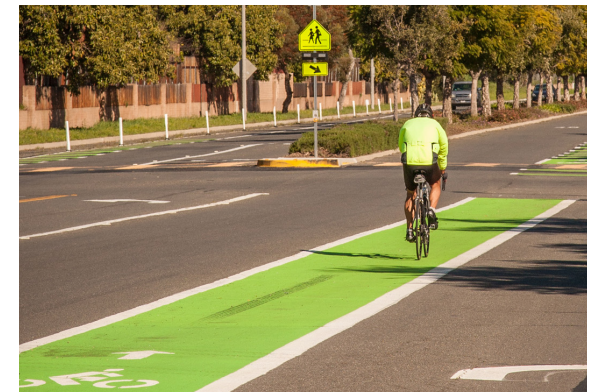
Colored Bicycle Facilities