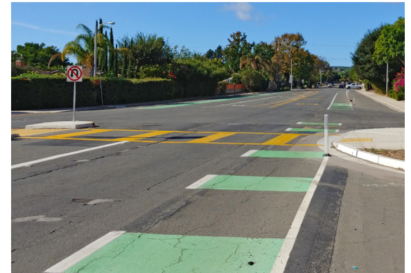
Green Transition Striping at Intersections

Two-stage turn queue boxes can provide a more comfortable left-turn crossing for many bicyclists because they entail two simple crossings, rather than one complex one. They also provide a degree of separation from vehicular traffic, because they do not require merging with vehicle traffic to make left turns. Bicyclists wanting to make a left turn can continue into the intersection when they have a green light and pull into the green bike box. Bicyclists then turn 90 degrees to face their intended direction and wait for a green light to continue through.