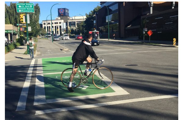
Two-Stage Turn Queue Box