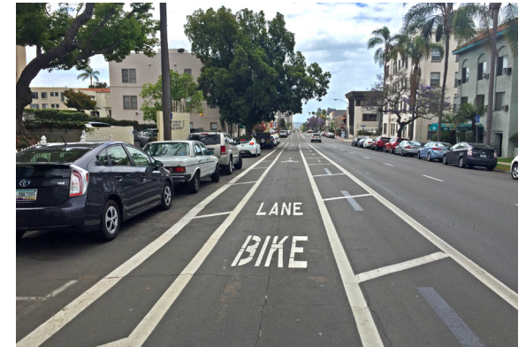
Buffered Bicycle Lane

A bike box is a designated area at the head of a traffic lane at a signalized intersection that provides bicyclists a safe and visible way to wait ahead of queuing traffic during the red signal phase. This positioning helps encourage bicyclists traveling straight through not to wait against the curb for the signal change.