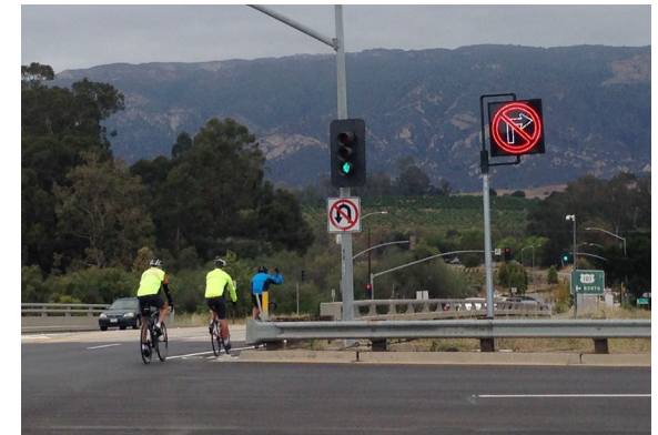
Bicycle Detection, LED Blank Out Sign