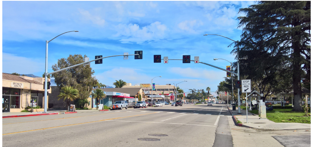
Pedestrian Hybrid Beacon

Signals and warning devices should be paired with additional pedestrian improvements, where appropriate, such as curb extensions, enhanced crosswalk marking, lighting, median refuge islands, and corresponding signage.