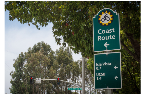
Signage and Wayfinding