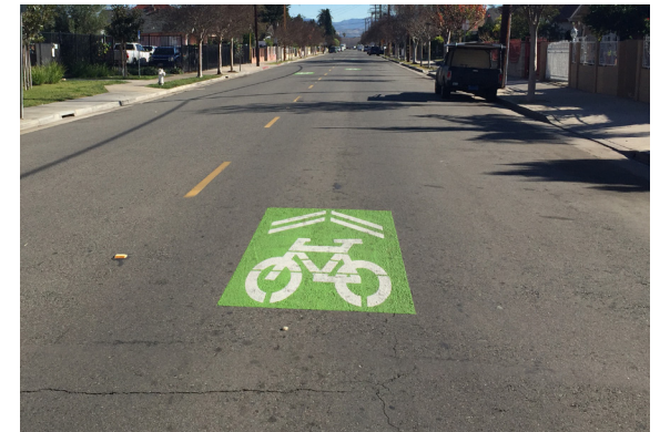
Shared Lane Marking (“Sharrows”)