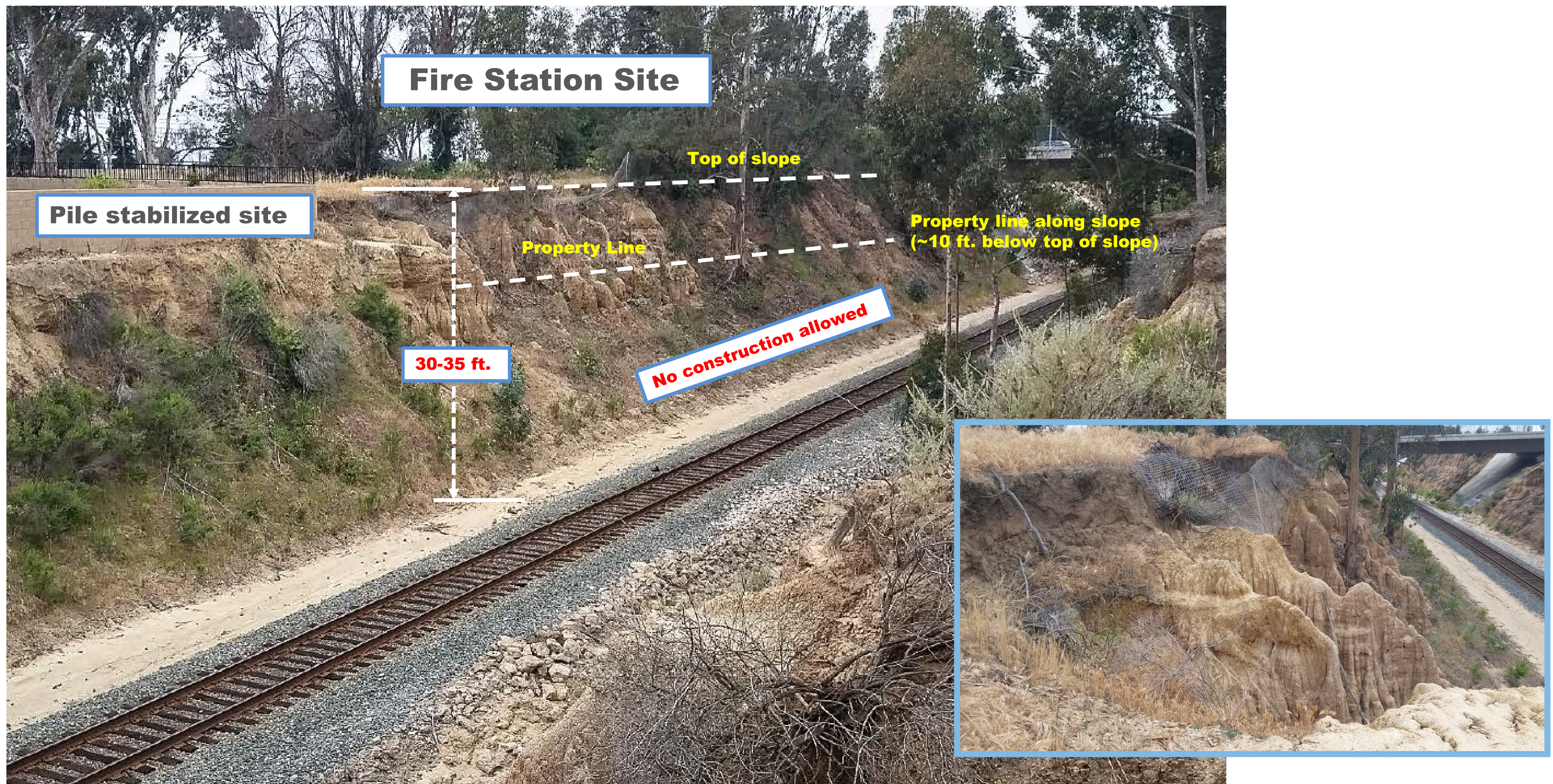
EXISTING SLOPE CONDITION - Erosion Prone Marine Terrace Deposits (sands and silts), requires stabilization