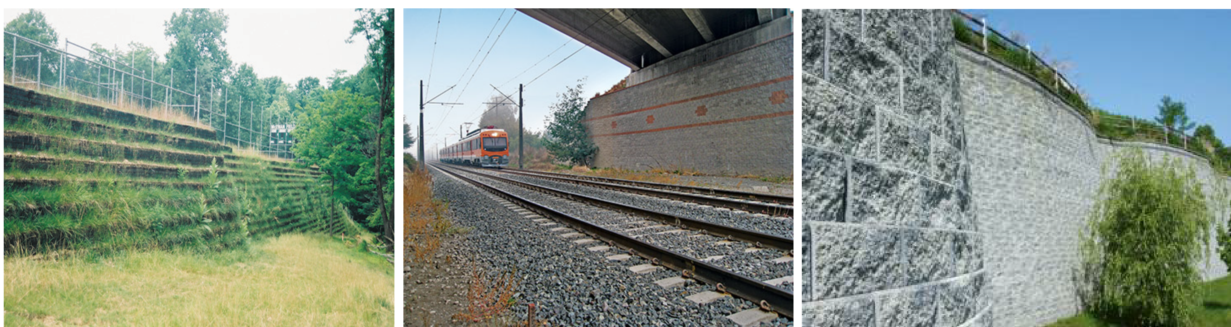
TYPICAL RETAINING WALL - Configuration/Design for Similar Projects