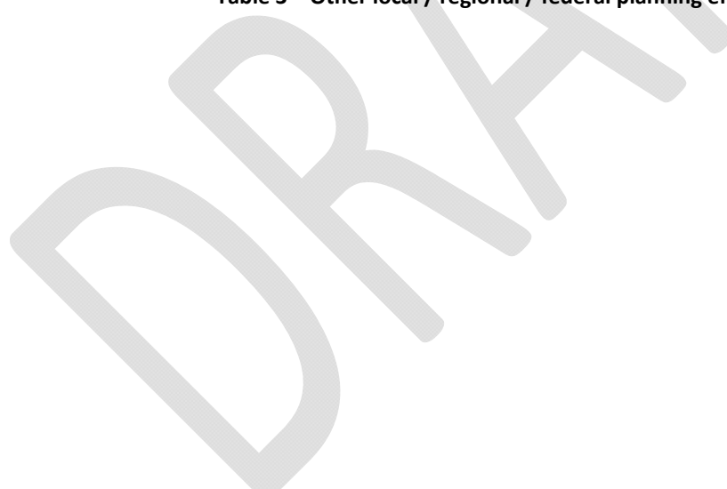
Table 3 – Other local / regional / federal planning efforts